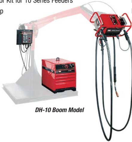
DH-10 Boom Model