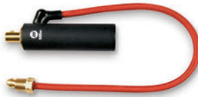
195 377 50-mm Dinse-style with water return line for water-cooled torch.