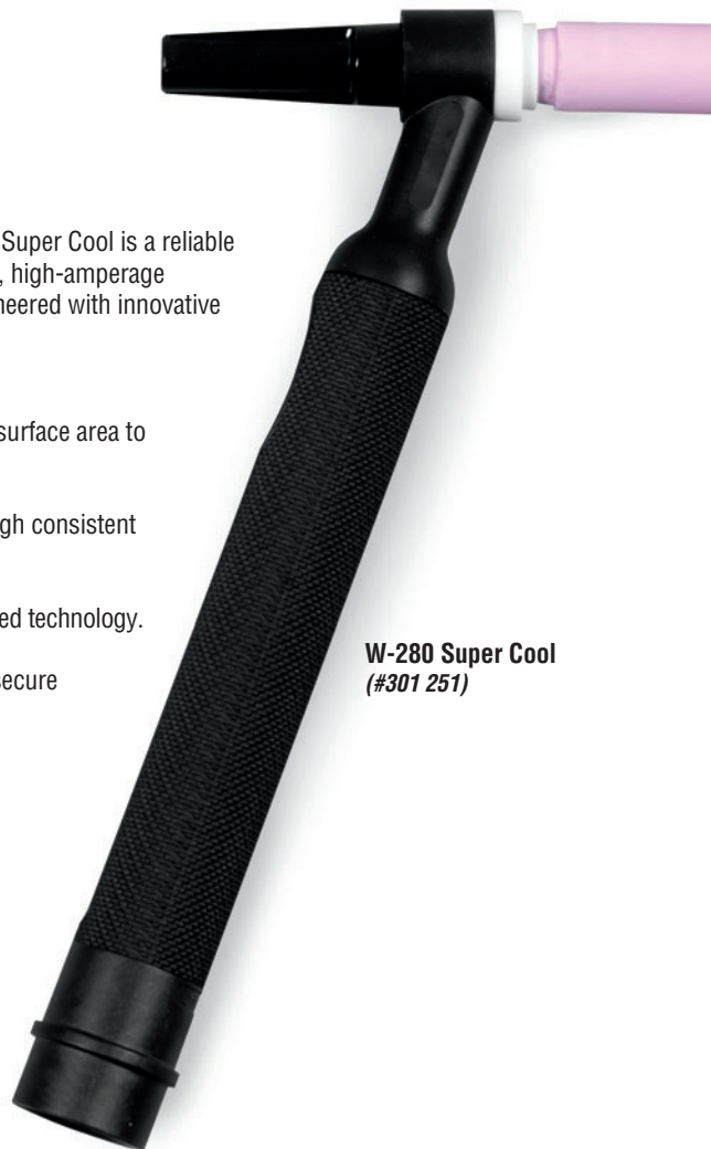
W-280 Super Cool (#301 251)

Note: Torch delivered may vary slightly from image shown.