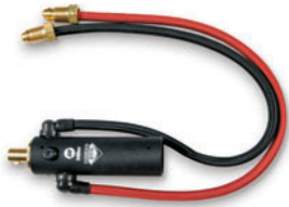
195 380 50-mm Dinse-style gas thru with gas and water return lines for water-cooled torch.