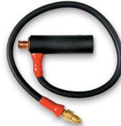
225 028 50-mm thread-lock-style for water-cooled torch.