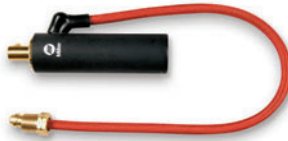
195 377 50-mm Dinse-style with water return line for water-cooled torch.