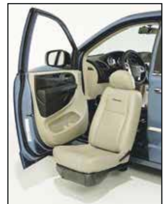
VALET™ SIGNATURE SEATING

Founded over 25 years ago, Bruno Independent Living Aids, Inc., is a world-wide manufacturer of accessibility products designed to enhance the lives of those challenged by limited mobility. In pursuing this goal, Bruno is proud to be the only U.S. manufacturer of indoor/outdoor stairlifts, interior/exterior scooter, powerchair and wheelchair vehicle lifts and vehicle seating products to be ISO 9001 Certified. This is one of the most stringent, widely-recognized quality standards in the world and your assurance that Bruno is committed to providing you with the highest-quality, most reliable products in the industry. Ask your certified Bruno dealer for details on all Bruno independence products.