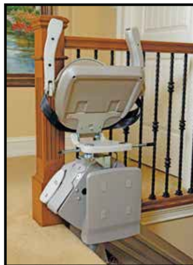
The arms, seat and footrest flip up, creating plenty of space to walk up the stairs.

Meeting additional standards from around the world, the Bruno Elan Straight Rail Stairlift is the new benchmark for Style, Performance and Affordability. Building on two decades of Bruno research, the Elan can transport up to 300 lb with ease and in total comfort. Look to Bruno for the finest Home Accessibility solutions.