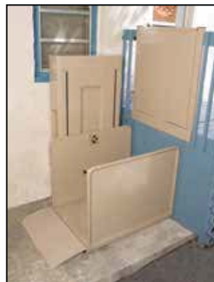
VERTICAL PLATFORM LIFT

The only 400 lb/181.8 kg capacity outdoor stairlift... an INDUSTRY EXCLUSIVE!