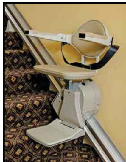
The hidden, rack-and-pinion drive system provides a smooth ride, without hesitation, when the unit stops and starts.