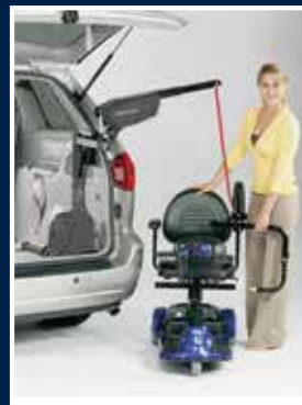
CURB-SIDER® VEHICLE LIFT