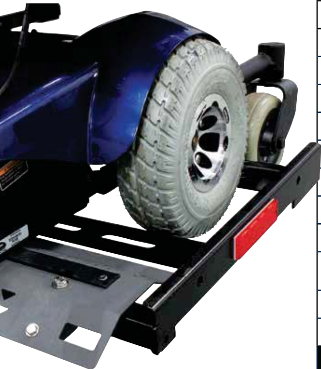
ASL-250HTP w/MWD platform option