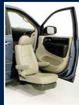
VALET® SIGNATURE SEATING