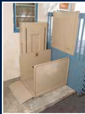
VERTICAL PLATFORM LIFT