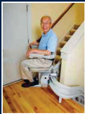
CUSTOM CURVED RAIL STAIRLIFT