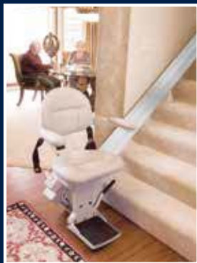
ELITE STRAIGHT RAIL STAIRLIFT