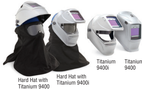
Hard Hat with Titanium 9400 Hard Hat with Titanium 9400i