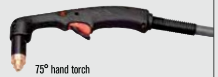
75° hand torch

(for more torch options, see www.hypertherm.com )