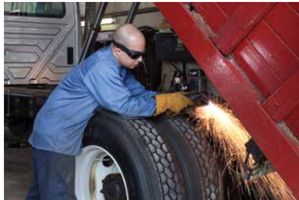
Vehicle repair and modification