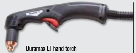
Duramax LT hand torch