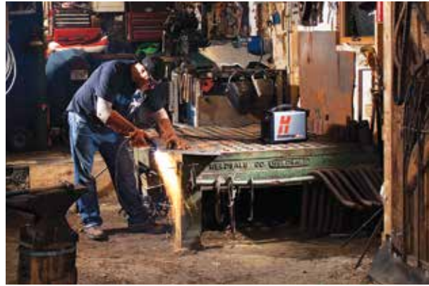
Home hobby and metal art

HVAC, agricultural, property/plant maintenance, fire and rescue, general fabrication, plus: