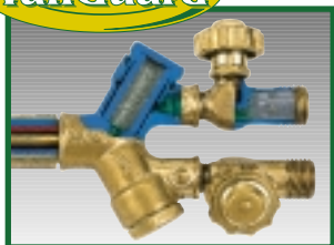
315FC Patent# 5407348