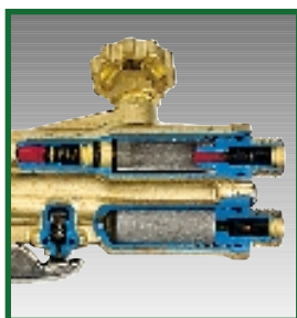
ST2600FC Patent# 5407348