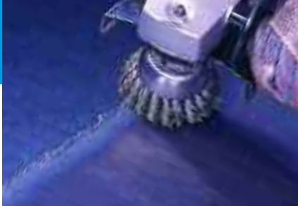
Removing slag from a flame-cut steel plate.

Most Weiler wire brushes are 100% recyclable.