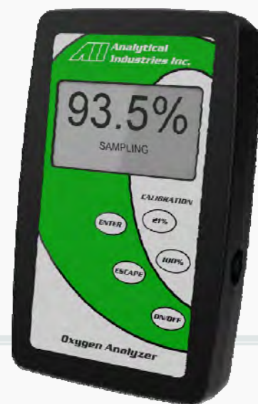
AII-2000 HC Oxygen Analyzer