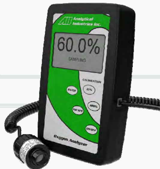
AII-2000 A Oxygen Analyzer