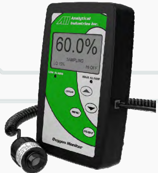
Aii-2000 M Oxygen Monitor