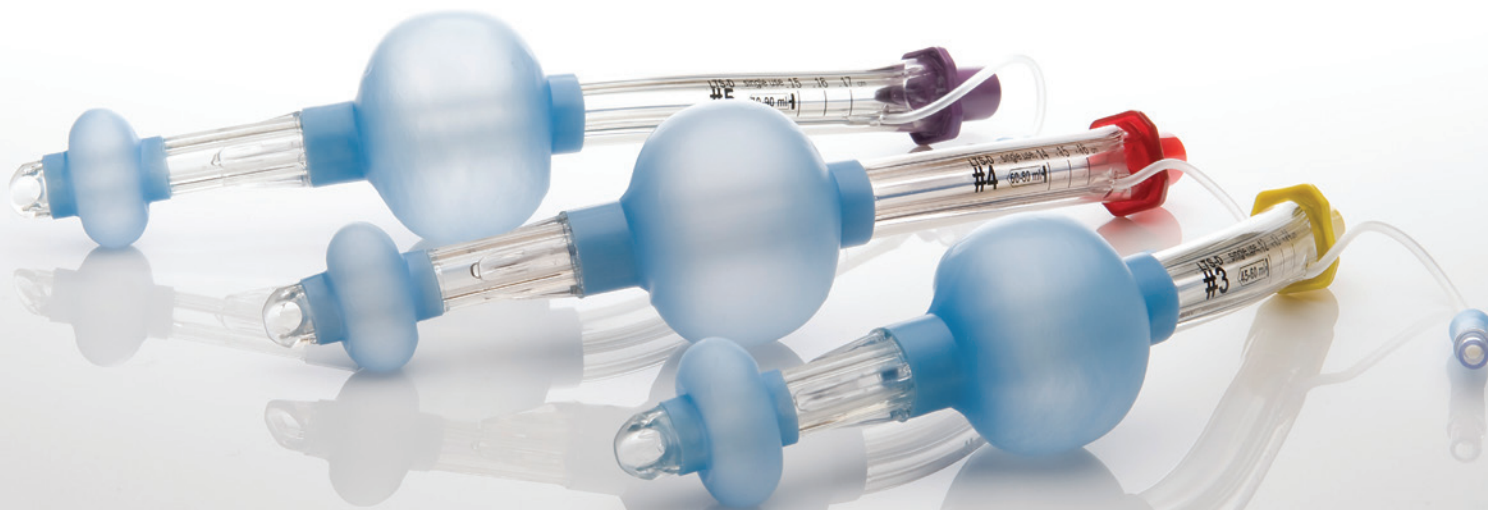
King LTS-D shown